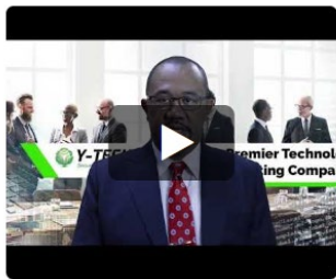
Y-Tech - Professional IT Services (Information Assurance, Cybersecurity, Program