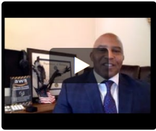
SD VOSB D&A Technologies Cyber Security & Engineering professionals