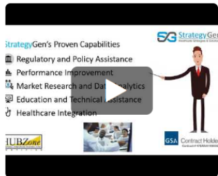
Strategy Gen HUBZone, GSA