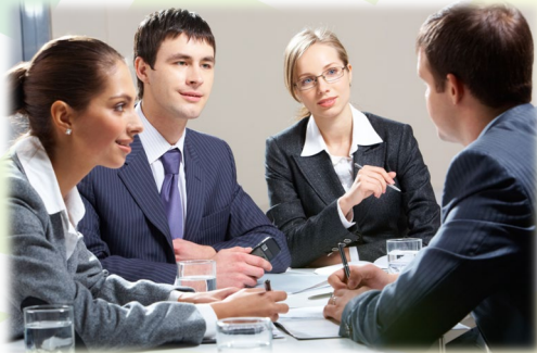
Recruiting (Cleared & Non-Cleared)