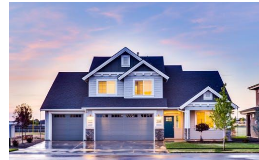
Real Estate & Default Management (residential)