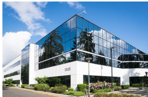
Facilities Maintenance (commercial)