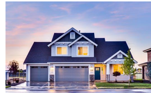
Real Estate: Asset & Default Management (residential)