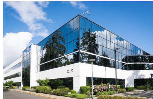
Facilities Maintenance (commercial)