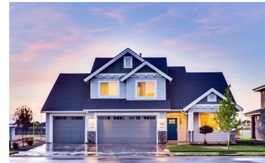
Real Estate, Asset & Default Management (residential)