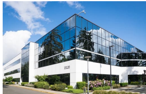
Facilities Maintenance (commercial)